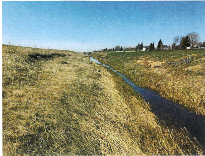
PHOTOGRAPH 1: FACING SOUTH WEST SHOWING SEVERE BANK FAILURE