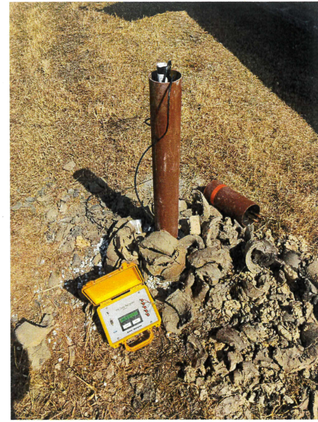
PHOTOGRAPH 2: VW PIEZOMETER IS TO BE PRESERVED